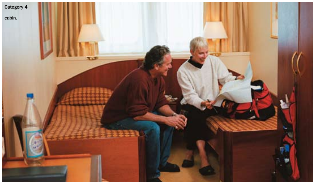
Category 4 cabin.