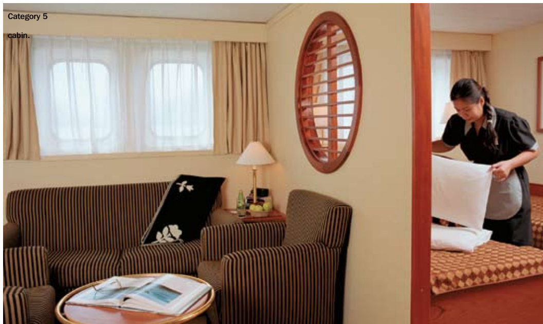
Category 5 cabin.