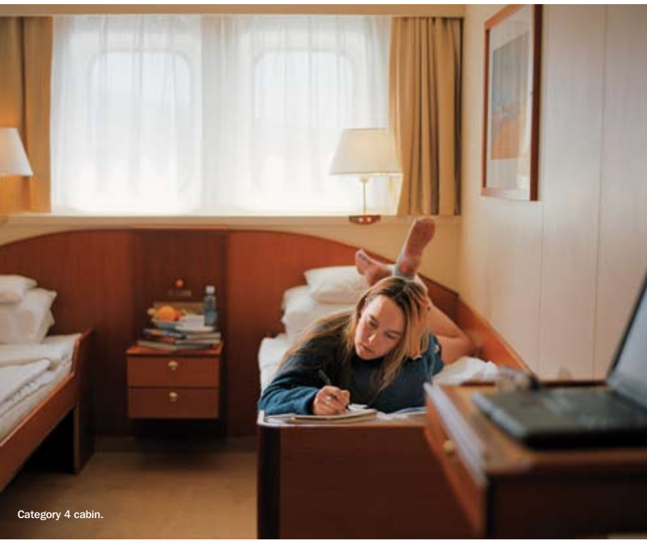
Category 4 cabin.