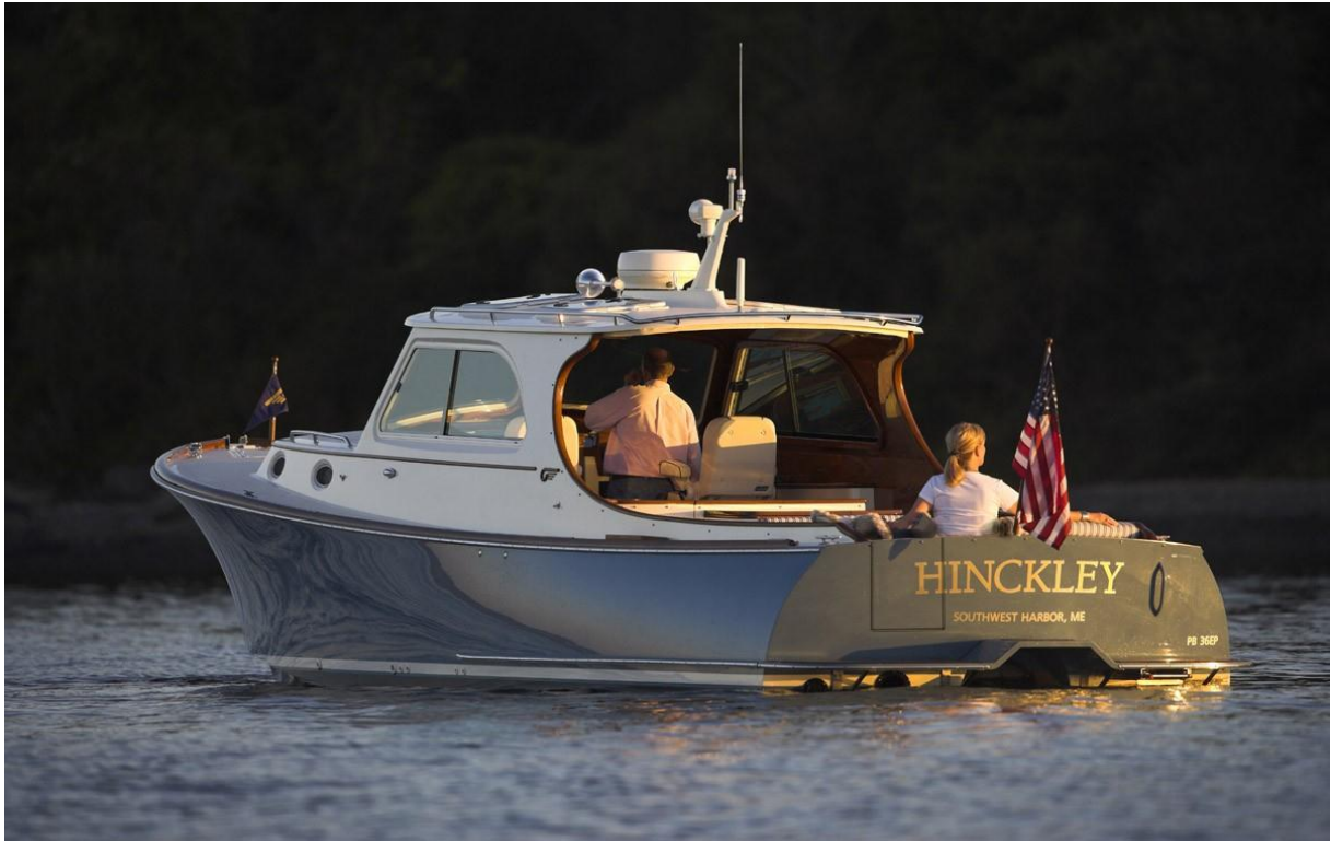
Hinckley Picnic Boat EP