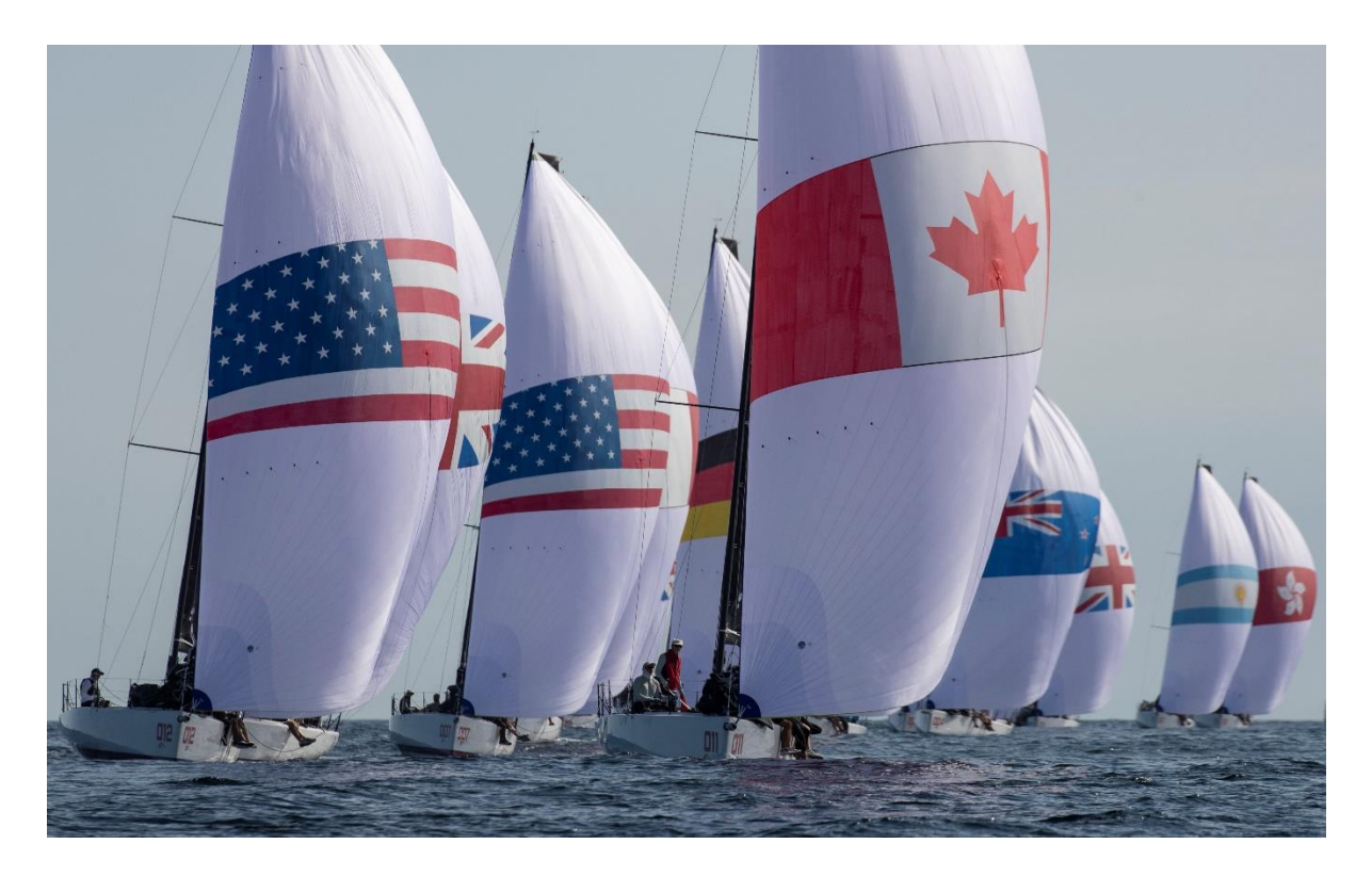
2021 Rolex New York Yacht Club Invitational Cup